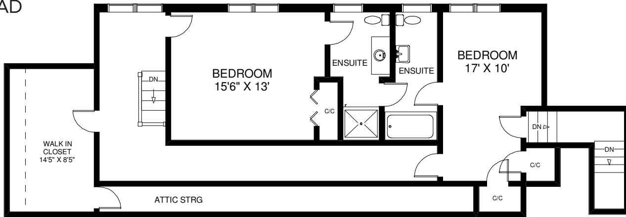
SECOND FLOOR APPROXIMATELY 1,150 SQ FT