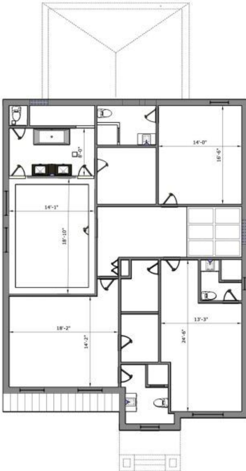
2ND FLOOR (2054 sqft) 53 Burnhamthorpe Cres